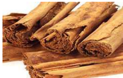
Fig. 2. Cinnamomum zeylanicum .