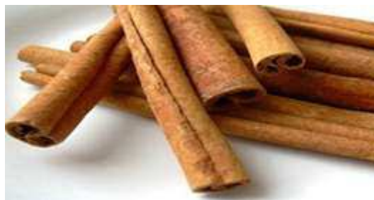
Fig. 1. Cinnamomum cassia .

Cinnamon is an evergreen tree belongs to Lauraceae family, which grows from 20 to 30 feet; the leaves are dark green on top and lighter green underneath. Fruits are black, pulpy, and aromatic. A flower is small, yellow. The diverse, spicy aroma of cinnamon inner bark, Cinnamomum cassia , is the spice sold as cinnamon in the United States Fig.1. Ceylon cinnamon, Cinnamomum zeylanicum , which is stated to as true or sweetcinnamon 8,9 Fig. 2.